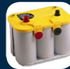
Battery & charger