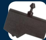
Die sets for brake & Air conditioning hoses